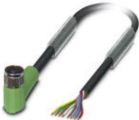
Sensor/Actuator cable, 8-position, PUR, Black RAL 9005, Free cable end, on Socket angled M8, Cable length: 5 m

Please be informed that the data shown in this PDF Document is generated from our Online Catalog. Please find the complete data in the user's documentation. Our General Terms of Use for Downloads are valid ( http://download.phoenixcontact.com )