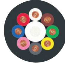
PUR halogen-free black [PUR]